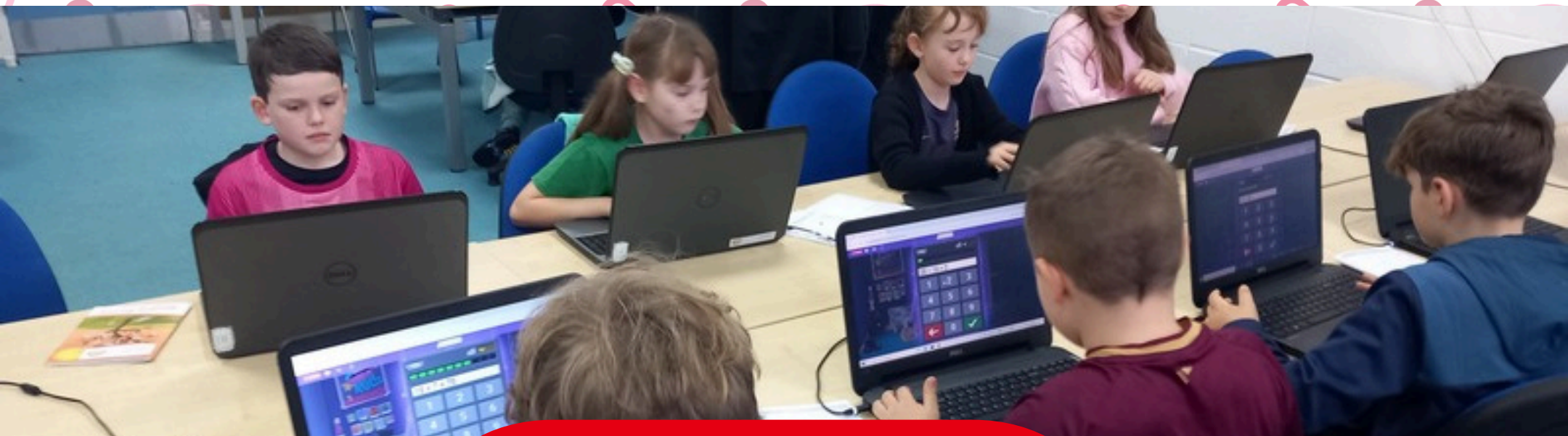
Number Day Fun